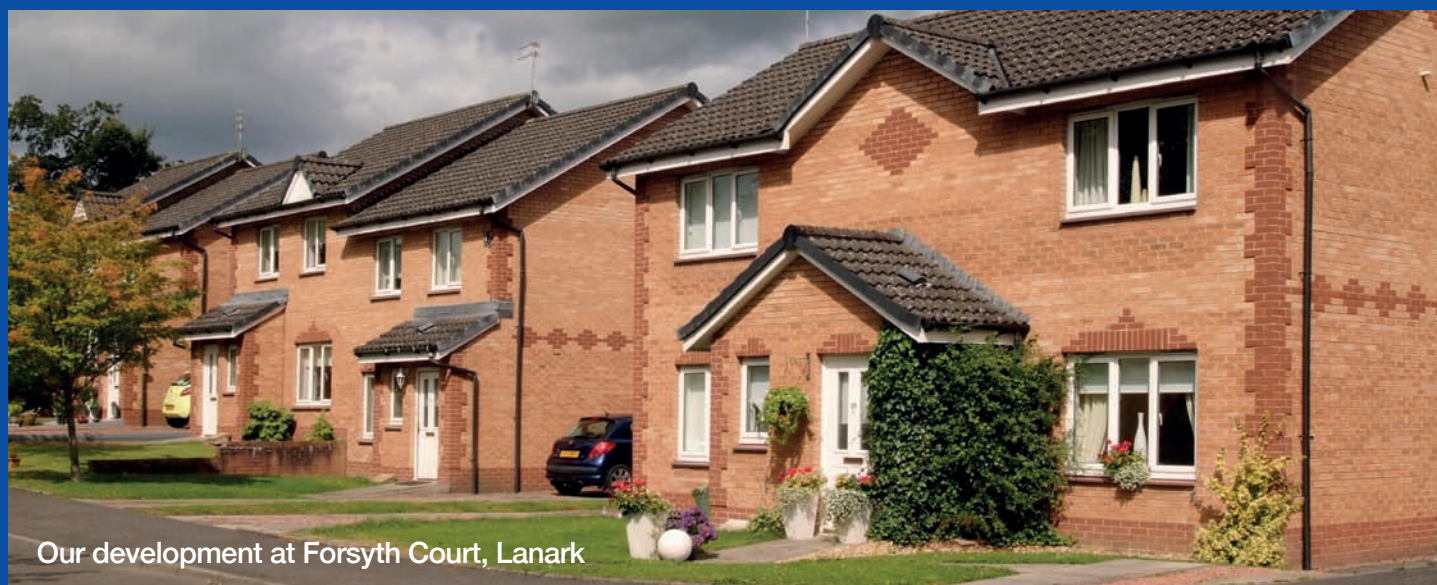
Our development at Forsyth Court, Lanark

https://www.southlanarkshire.gov.uk/forms/form/316/en/housing_application