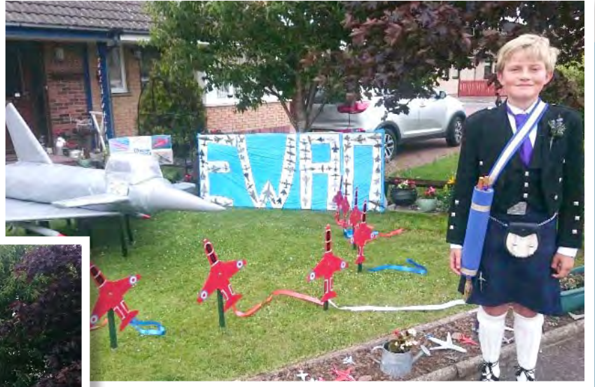
Ewan Tweedie - First Page