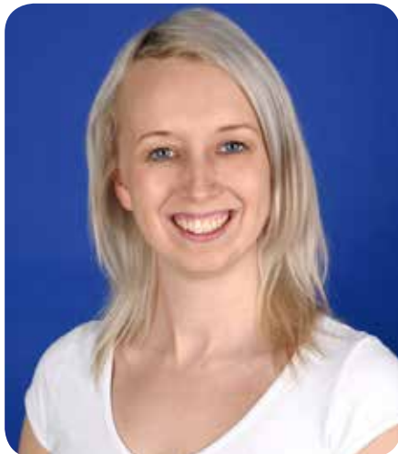
Our Technical Services Team